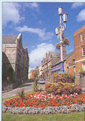
Angel Hill, Tiverton

At the end go through a gate and along the field edge, next to a stream to the Bickleigh Mill complex. Go through the gates to the lane and turn right to continue on the Exe Valley Way south.