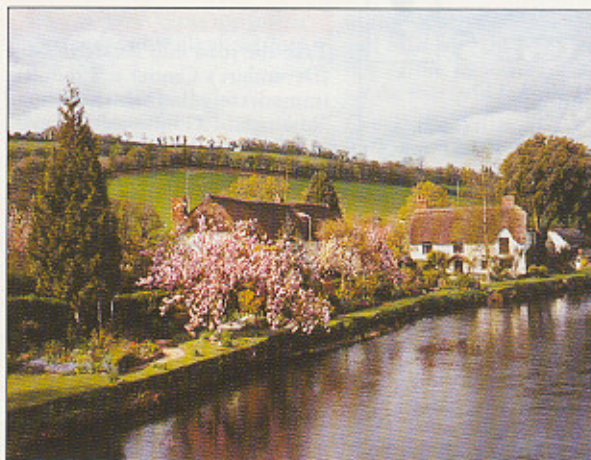
Bickleigh village shop is straight on beyond the Mill.

Cross the bridge to the main road at Bickleigh. Cross the Exe on Bickleigh Bridge then fork left down the minor road to Bickleigh Mill (Devonshire's Centre).